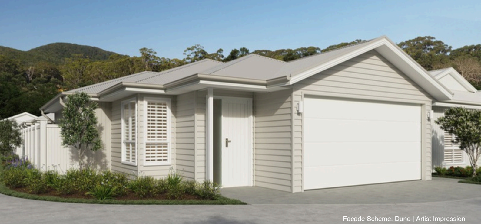
Facade Scheme: Dune | Artist Impression