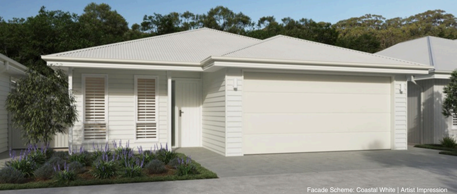
Facade Scheme: Coastal White | Artist Impression