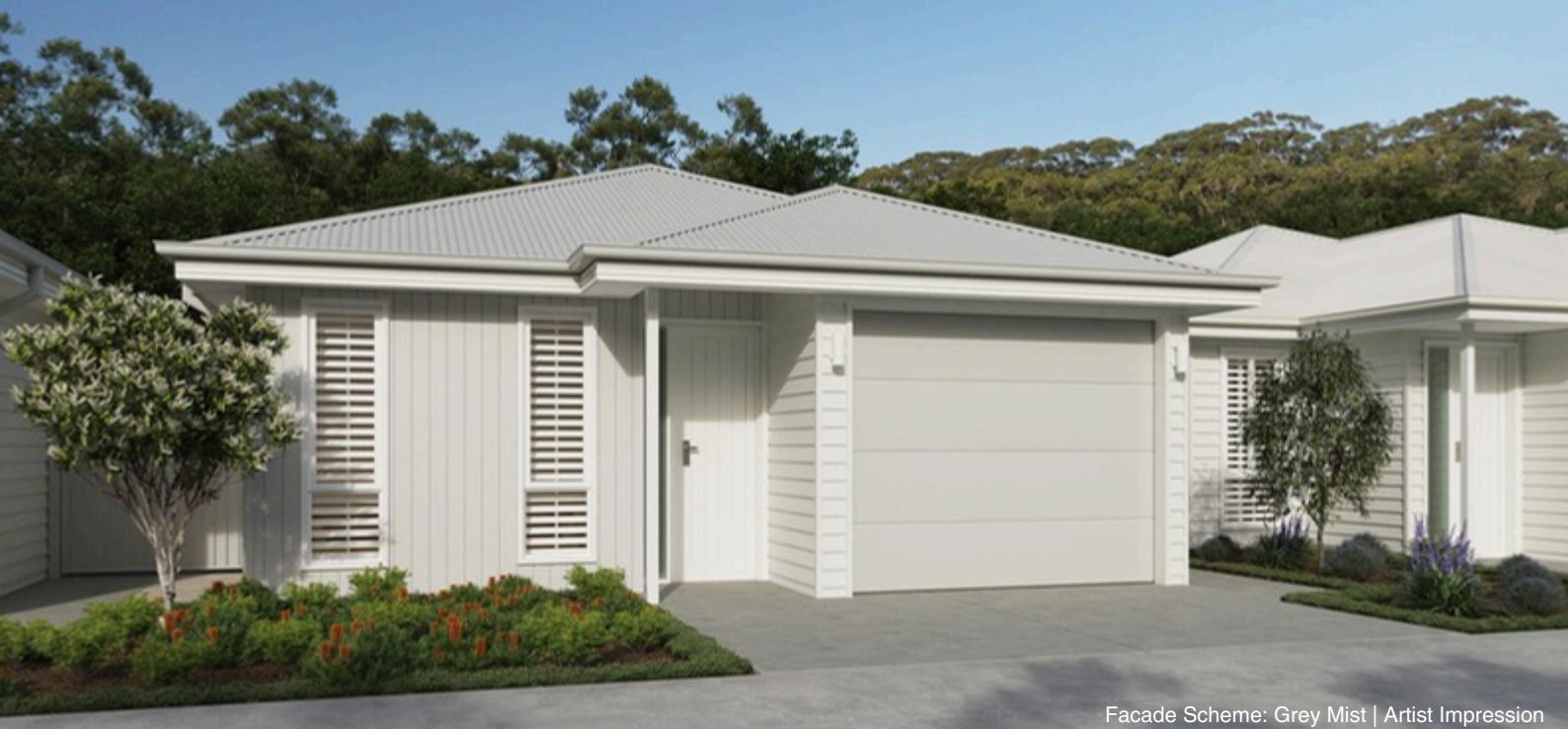
Facade Scheme: Grey Mist | Artist Impression